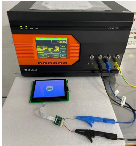
3.2 群脉冲测试图 EFT test