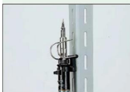
2 Magnet attachment