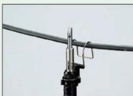
3 Hanging from cable