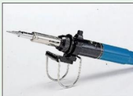
1 Iron Stand

ENGINEER Original Multi-Holder contained in SKC-70 & SKD-70