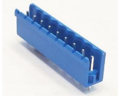
5,08 mm SBDK-E 90° Closed (10.409)