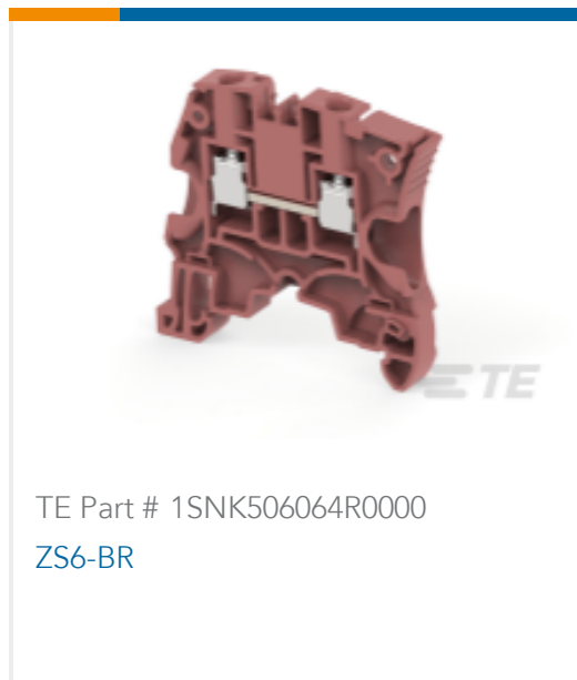
TE Part # 1SNK506064R0000 ZS6-BR