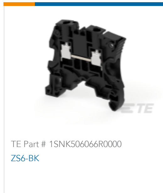
TE Part # 1SNK506066R0000 ZS6-BK