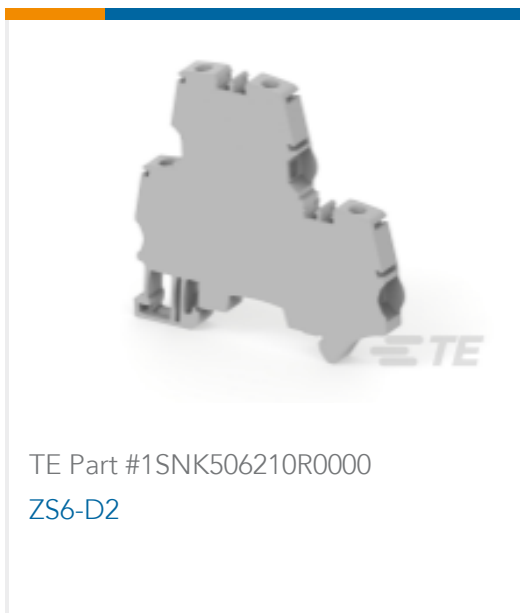
TE Part #1SNK506210R0000 ZS6-D2