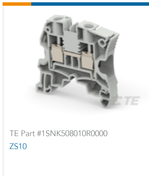
TE Part #1SNK508010R0000 ZS10