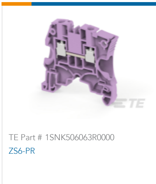
TE Part # 1SNK506063R0000 ZS6-PR