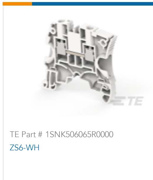
TE Part # 1SNK506065R0000 ZS6-WH