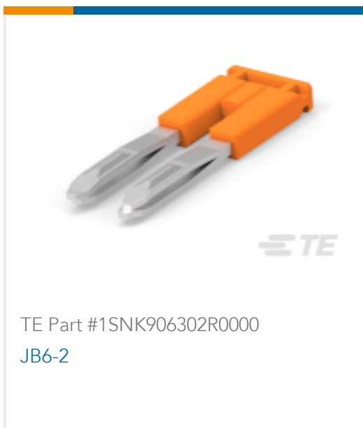
TE Part #1SNK906302R0000 JB6-2