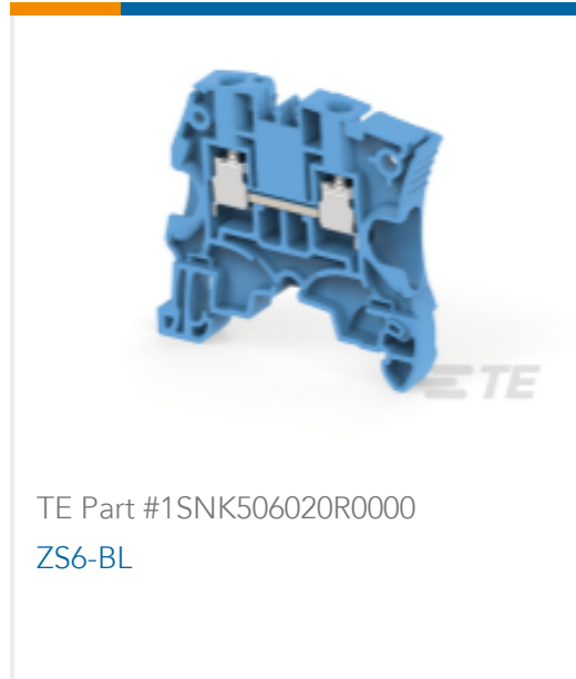
TE Part #1SNK506020R0000 ZS6-BL