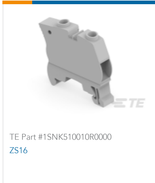
TE Part #1SNK510010R0000 ZS16