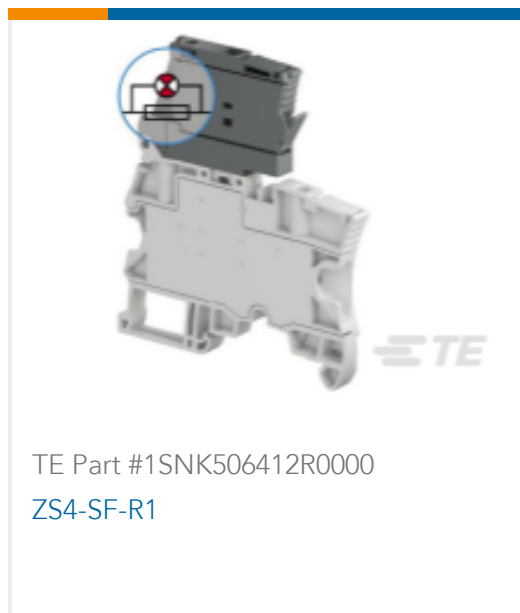
TE Part #1SNK506412R0000 ZS4-SF-R1