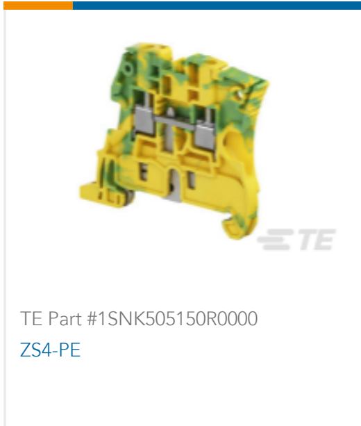
TE Part #1SNK505150R0000 ZS4-PE