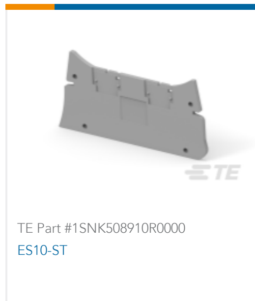
TE Part #1SNK508910R0000 ES10-ST