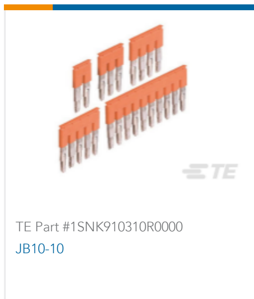
TE Part #1SNK910310R0000 JB10-10