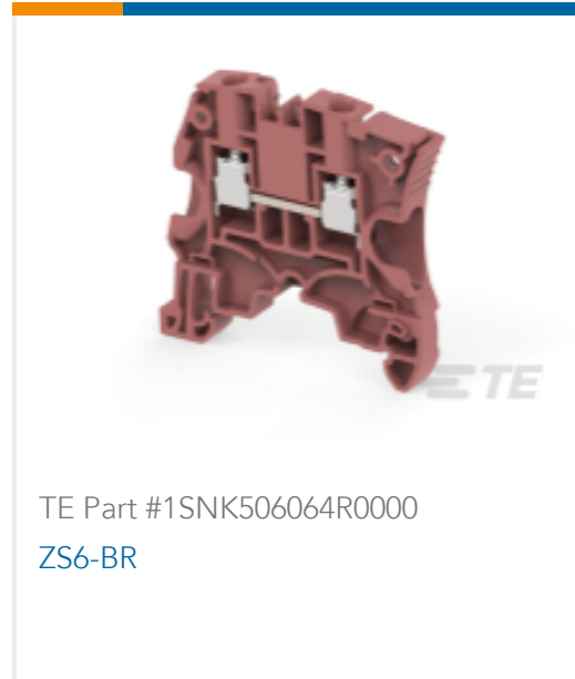
TE Part #1SNK506064R0000 ZS6-BR