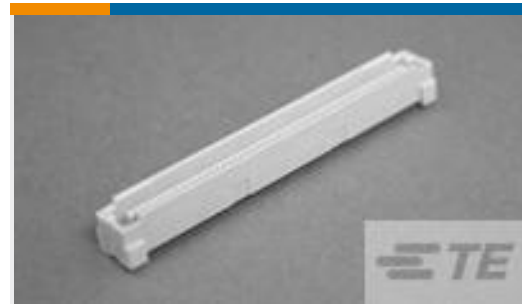
TE Part #1-5177986-1 0.8FH,P06H.5,040,08/Sn,TR,SC