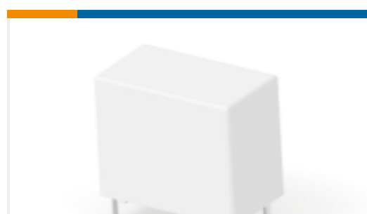
TE Part #1721260-5 OJ-SS-112LMH2