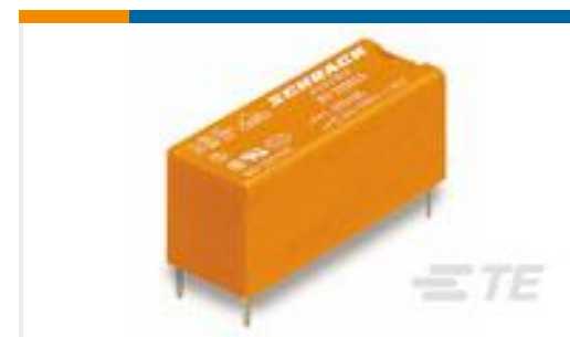
TE Part #2-1393225-6 RY612012