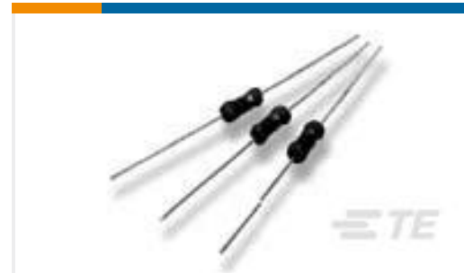
TE Part #1-1625885-2 1W SM M/OX 5% 100R