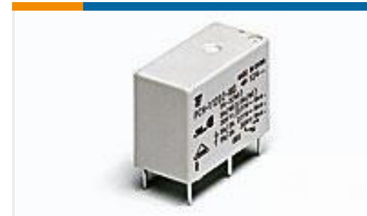
TE Part #1461352-5 PCH-112L2M,000