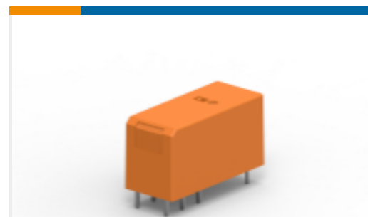
TE Part #6-1415899-4 PCB Power Relay: 12-16 Amp, Monostable