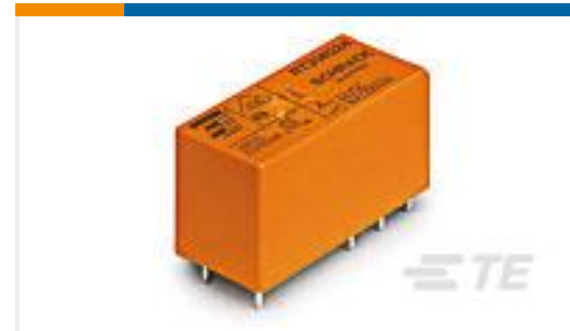
TE Part #9-1393239-1 RT314005